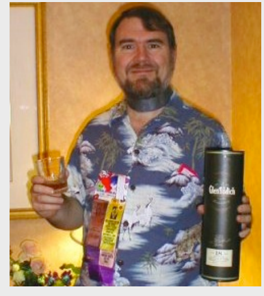
Helmuth headline logo by the late Joe Mayhew (in 1997) and Boskone 50 logo by Alice Lewis